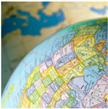
Great Resources for Middle School