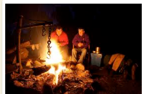
Summer means cooking around the campfire