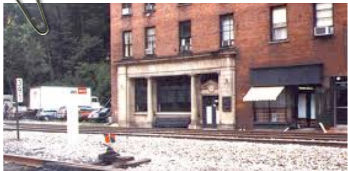
Thurmond, West Virginia

In the weeks that we have left challenge your students to “read and write to learn” this summer!