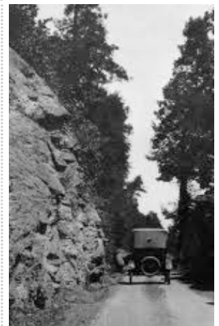
Fayette Station Road