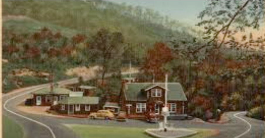
Chimney Corner in days gone by