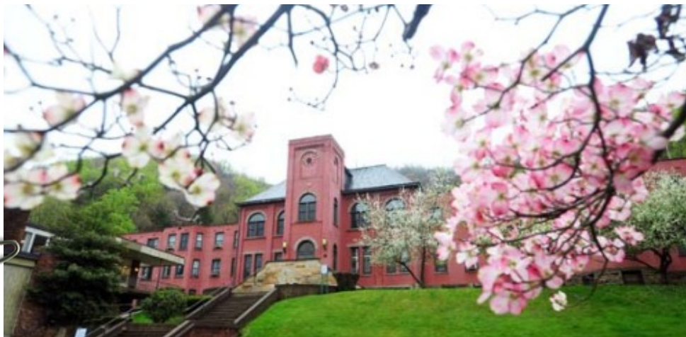
West Virginia Tech