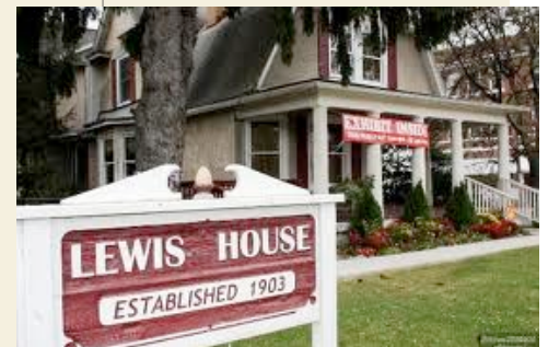
Lewis House, Oak Hill